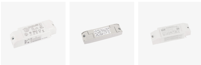
Driver ON-OFF 150-500mA 6,3-21W 240V Ref. 4.1069.1101